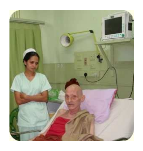
In ICU, 2 days before he died.