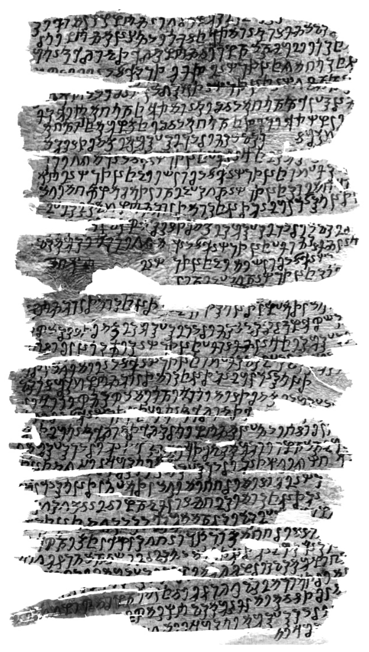
Gandhari Asṭāsāhasrikā Prajñāpāramitā manuscript.