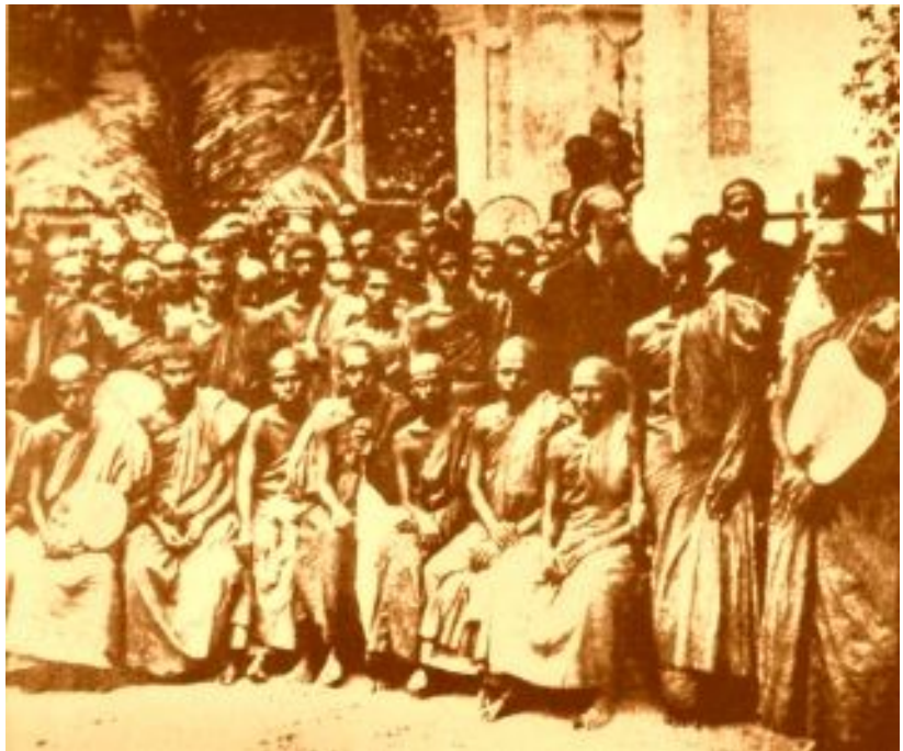
Col. Olcott with a group of monks

A fighter was needed to supply the dynamic energy; the hour produced the man. He was Ven. Migettuwatte Gunānanda. There is an unauthenticated story that as a layman he had joined a class for the training of catechists held by a Christian clergyman, a well-known Sinhala scholar, the Rev. C. Alwis. Whatever the truth of this story may be, Ven. Migettuwatte seems to have spent several years in a thorough reading of Christian books and also the works of critics of Christianity. He entered the sangha at Kotahena temple and started battle with the missionaries.