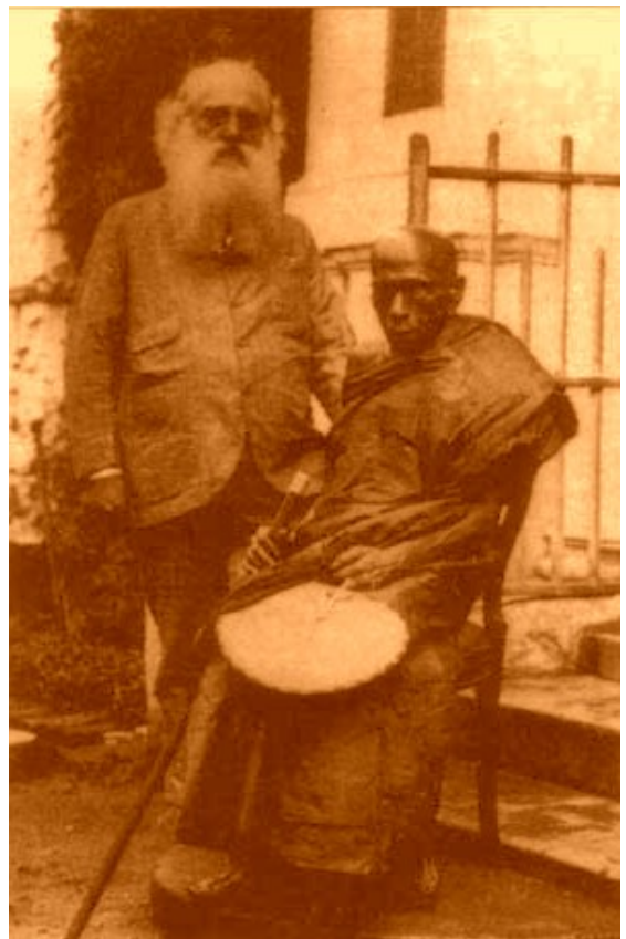
Olcott with Hikaduwa Sumangala Thera

Therefore the two decades between 1870 and 1890 became a crucial period in the history of modern Ceylon. The four notables in this period were Venerable Migettuwatte Gunānanda, Venerable Hikkaduwe Sri Sumangala, Maha Nayaka Thera of